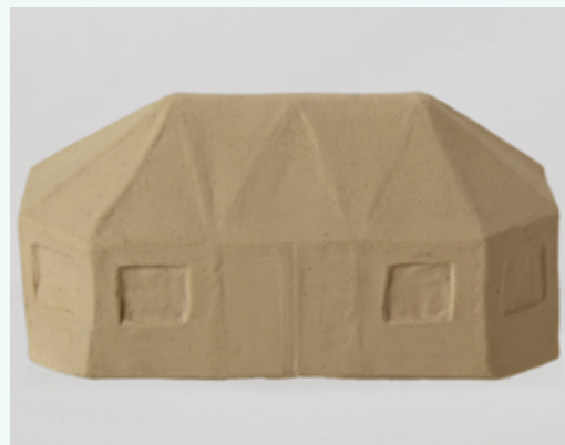
Chelsea Gay Steinberg. In Process, 2019. Plastilene clay. 6 in. x 2.5 in. x 2.5 in.