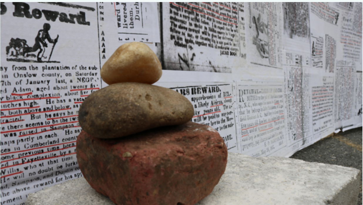
Stones placed at each corner of the sukkah honoring self-liberating ancestors.