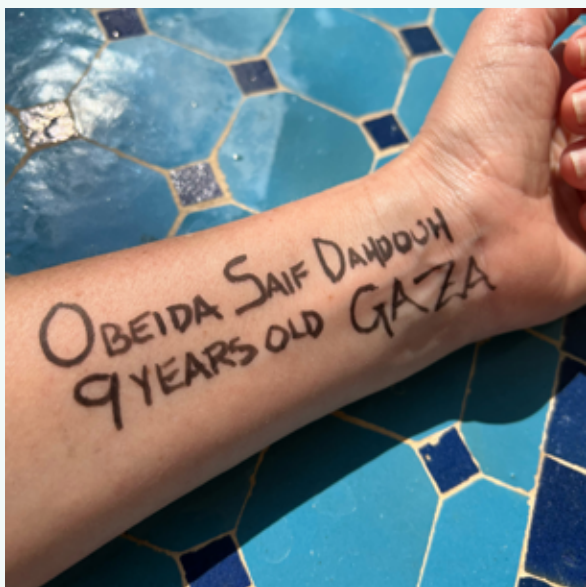
May 11, 2022