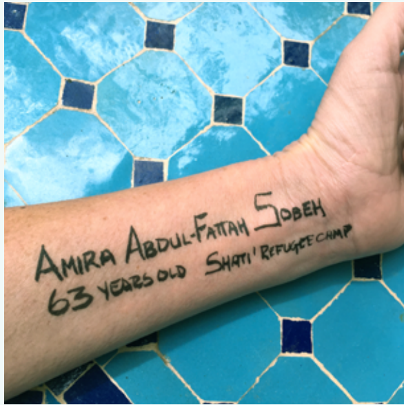
May 24, 2021