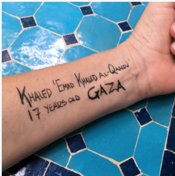
June 29, 2021