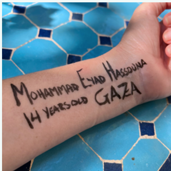
August 8, 2022