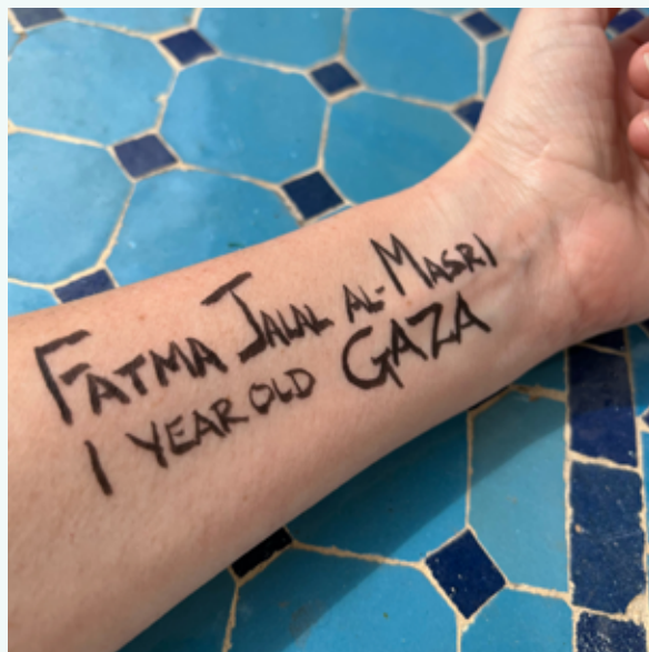
April 16, 2022