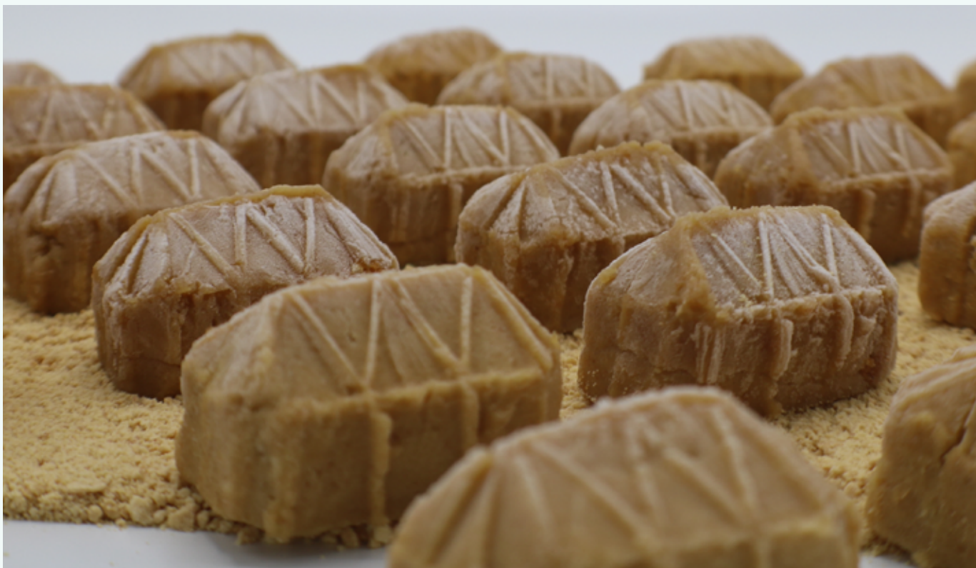
Chelsea Gay Steinberg. Help Yourself (Processed II), 2020. Cake pops molded into internment camp tents, graham cracker crumbs, photo tent. 48 in. x 48 x 48 in.

and a strong sense of justice. A number of her projects address the trauma of failed social policies with materials that evoke the body—food, emergency blankets, diapers—“drawing policy and statistic into an uncomfortably intimate context.”