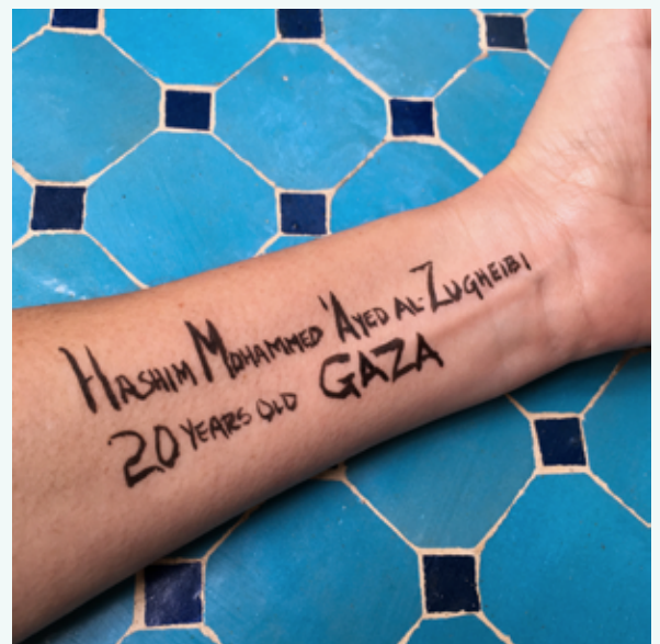
July 5, 2021