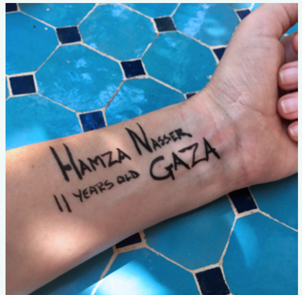
June 28, 2021