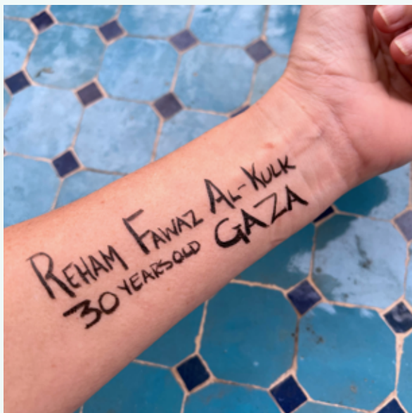
December 6, 2021